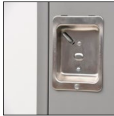
Stainless steel recessed padlock handles Magnetic latch ensures door is properly fastened when closed