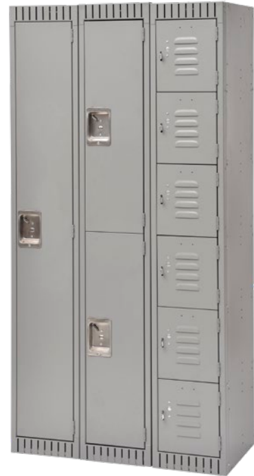
16-gauge frames, 24-gauge body and shelves