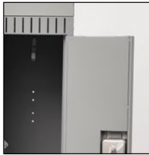
Double pan construction doors, 20-gauge outer and 24-gauge inner pans (single & double tier)